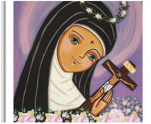
St. Rita of Cascia, Pray for Us